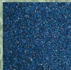
PAVIGYM BLUE TURF