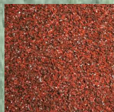
PAVIGYM BRICK TURF