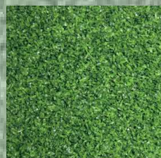
PAVIGYM GREEN TURF