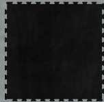
PAVIGYM B. MARBLE