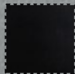
PAVIGYM JET BLACK