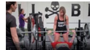
FREE WEIGHT AREA.