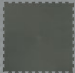
PAVIGYM STONE GREY