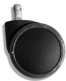
Standard 65 mm, black (option white)