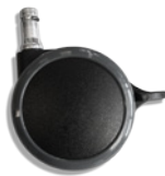
Optional 65mm locking, black or white