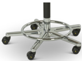
Foot support ring

X = standard feature, o = optional accessory, - = not available