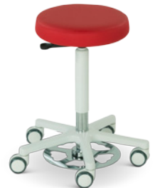
White base and castors