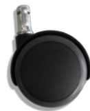
Optional 50 mm brake-loaded, black (locks when seated)