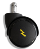
Optional 50 mm ESD, black (electrically conductive)

*) Mechanism that is flexible in every direction. Seat adjusts to user's movements, increasing the reach and reducing the strain on the sternum. This feature activates the person sitting and reduces back fatigue, eliminating the need for additional angle adjustment.