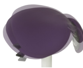
Swinging saddle *)